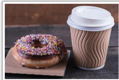
Join us for coffee and donuts, as we honor the work of two incredible community partners

We recommend that all attendees wear masks