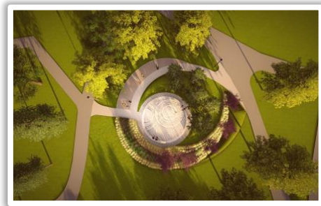
Visit the Survivors Memorial

If you would like to learn more about the memorial, visit: www.survivorsmemorial.org/